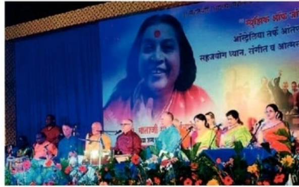
A troupe of 40 artistes performing at 'Sahajyog Meditation Music Parv' organised in Yavatmal.

These artists from Australia, Newzealand, South Africa, Malaysia, Greece and India highlighted the salient features and useful nuances