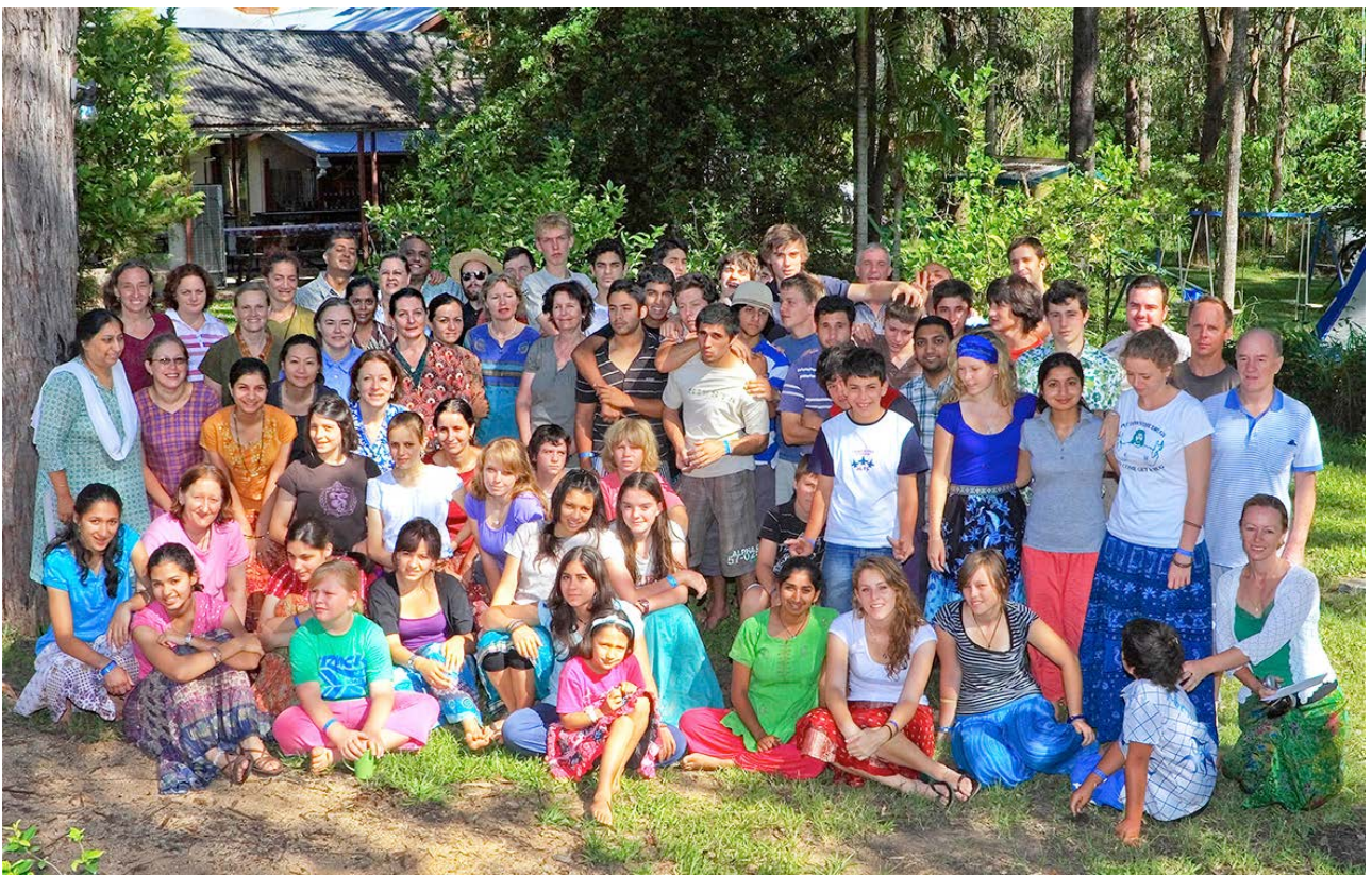
Early days at Wamuran. Recognise anyone?